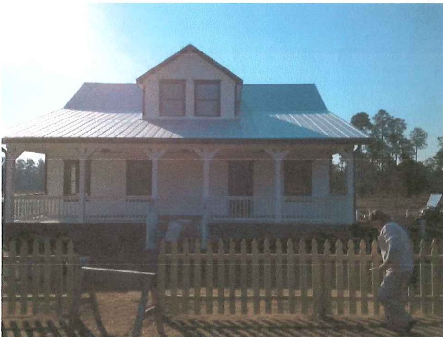
REAR (NORTH) VIEW