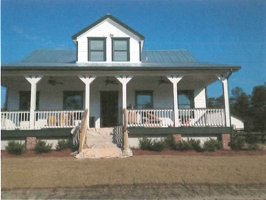
FRONT (SOUTH) VIEW

If using the Elevation Certificate to obtain NFIP flood insurance, affix at least 2 building photographs below according to the instructions for Item A6. Identify all photographs with date taken; "Front View" and "Rear View"; and, if required, "Right Side View" and "Left Side View." When applicable, photographs must show the foundation with representative examples of the flood openings or vents, as indicated in Section A8. If submitting more photographs than will fit on this page, use the Continuation Page.