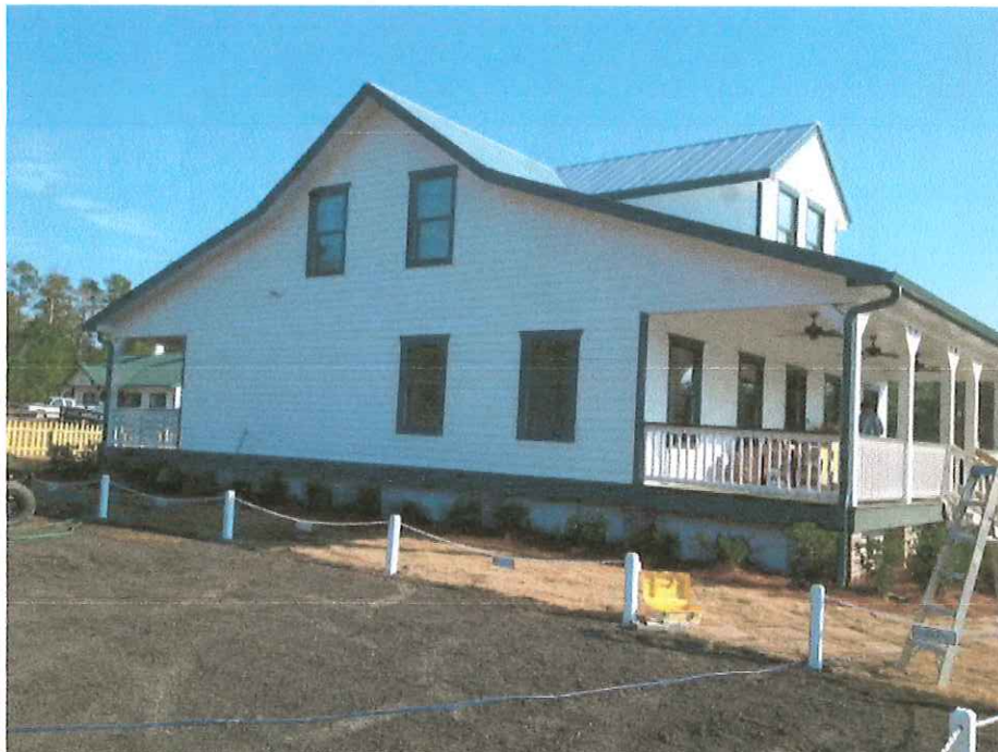
LEFT SIDE (WEST) VIEW