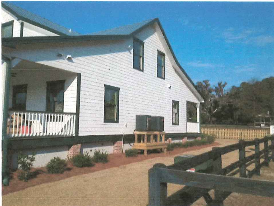
RIGHT SIDE (EAST) VIEW with A/C PLATFORM

If submitting more photographs than will fit on the preceding page, affix the additional photographs below. Identify all photographs with: date taken; "Front View" and "Rear View"; and, if required, "Right Side View" and "Left Side View." When applicable, photographs must show the foundation with representative examples of the flood openings or vents, as indicated in Section A8.